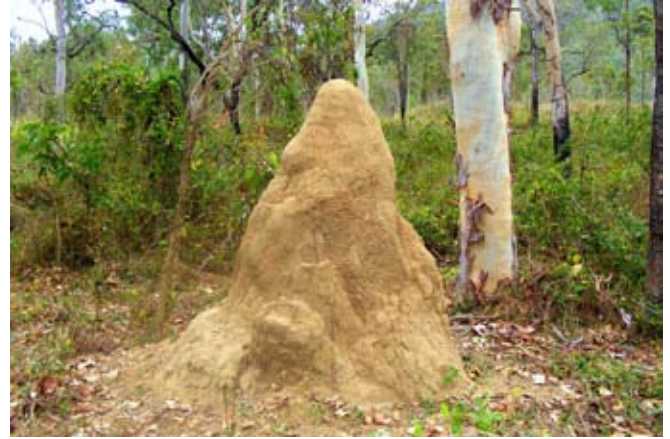
Figure 6. Coptotermes acinaciformis constructs a mound north of the Tropic of Capricorn.